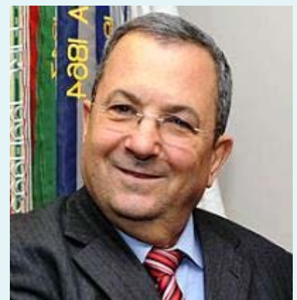
Photo: Israeli Defence Minister Ehud Barak

"Tough sanctions and a united diplomatic front are the best chance for crippling Iran's nuclear programme," urged a New York Times op-ed on Feb. 3. ☞